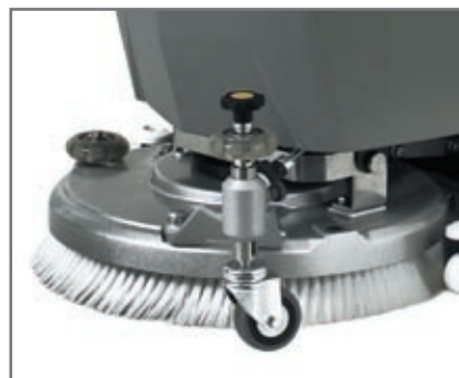
... while the practical external wheel allows the user to adjust it in height, thus making Freccia 15 perfectly suitable for any kind of floor