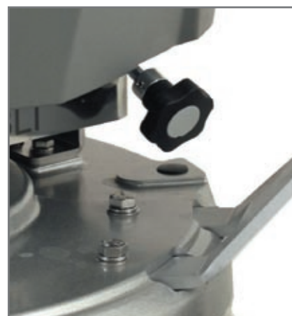
The front knob makes the brush head easily adjustable ...