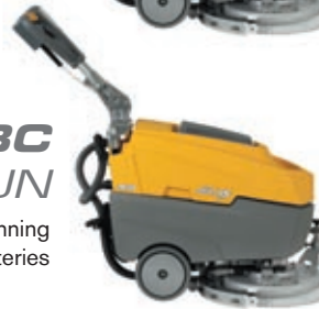
M38 BC LONG RUN Battery powered with top running time, thanks to the XFC batteries