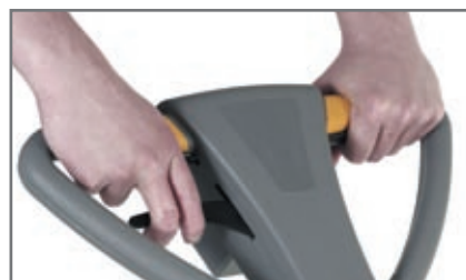
Ergonomic and completely adjustable, the new handle ensures perfect manoeuvrability and control