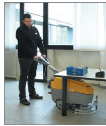
Real compact dimensions make the machine ideal for cleaning in "narrow" areas

FRECCIA 15 Freccia 15 is available in both cable and battery versions.