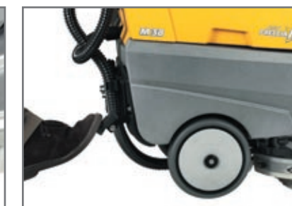
New squeegee pedal lifting system; even more practical and reliable