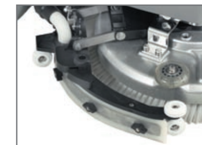
Compact squeegee: immediately behind the brush, able to curve up to 270°, so completely covering the cleaning path (even on sharp curves); for perfect drying results