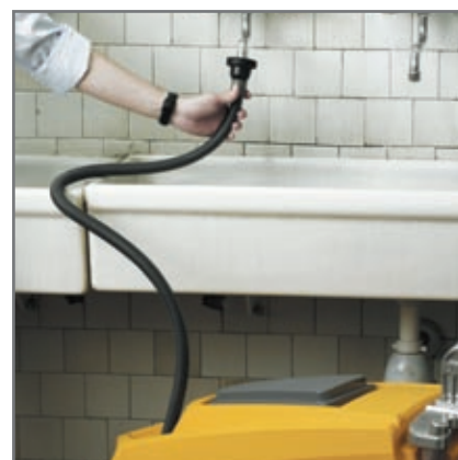
The solution tank can be quickly filled, thanks to the wide filling port and the practical filling hose