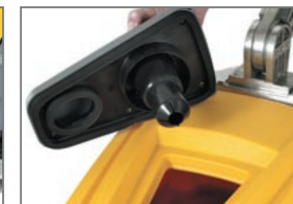
Recovery tank: easy to clean ...