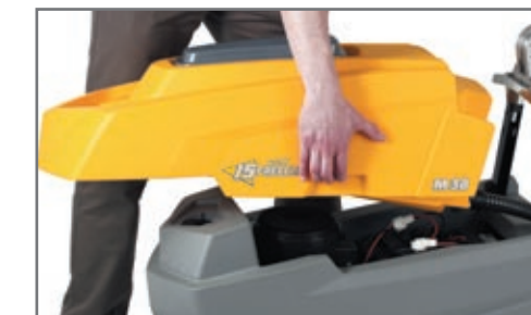
... it can be easily removed as well , to transport, empty and clean it without any effort