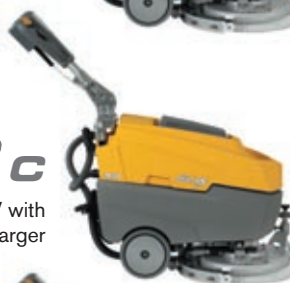
M38 c Battery powered 24 V with standard on-board charger