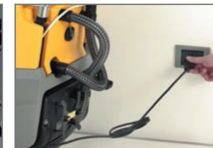
Standard on-board battery charger; for a quick recharge of the machine at any convenient location