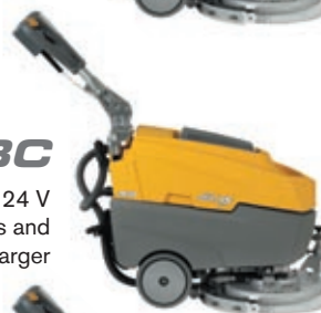
M38 BC Battery powered 24 V with standard batteries and on board charger