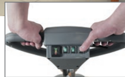
Three separate buttons for an easy management of all the main working functions